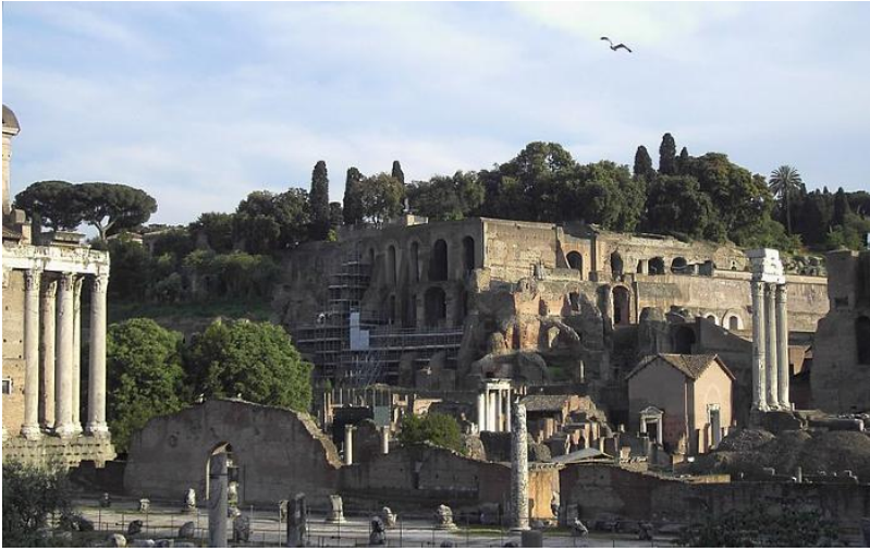
Palatine Hill seen from the Roman Forum (Lalupa [CC BY-SA 3.0 ( http://creativecommons.org/licenses/by-sa/3.0/ )]) https://commons.wikimedia.org/wiki/File:Palatino_(Palatine_Hill,_Rome).jpg