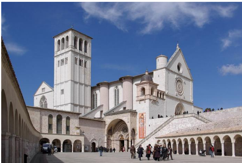
Fig.1: Overview of the Basilica Papale di San Francesco d'Assisi. Photo of Berthold Werner. Public domain.

https://en.wikipedia.org/wiki/Basilica_of_Saint_Francis_of_Assisi#/media/File:Assisi_San_Francesco_BW_2