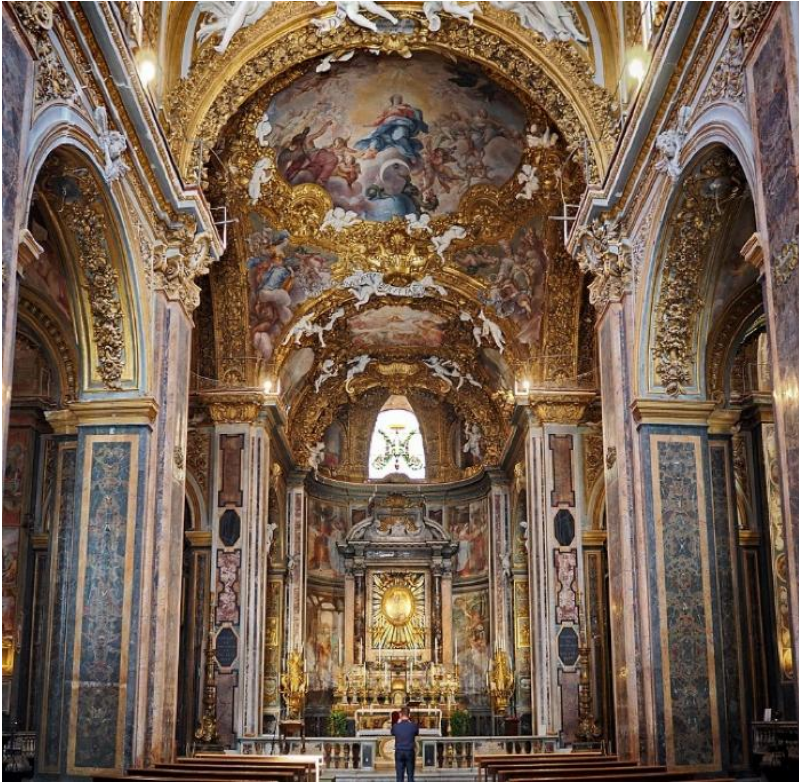
Apse of Santa Maria dell'Orto