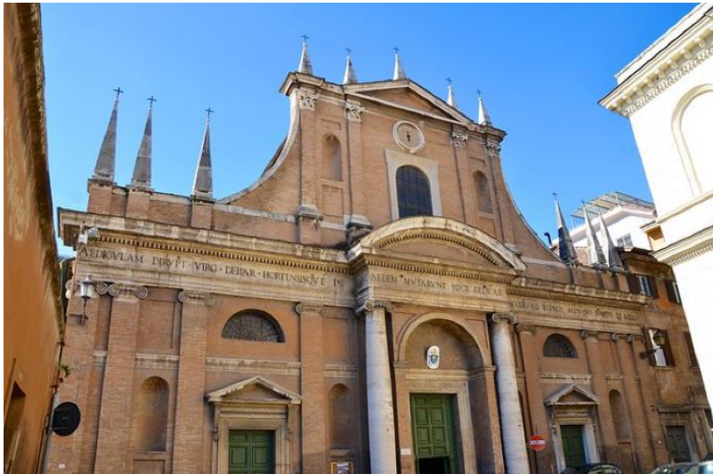
Façade of the church